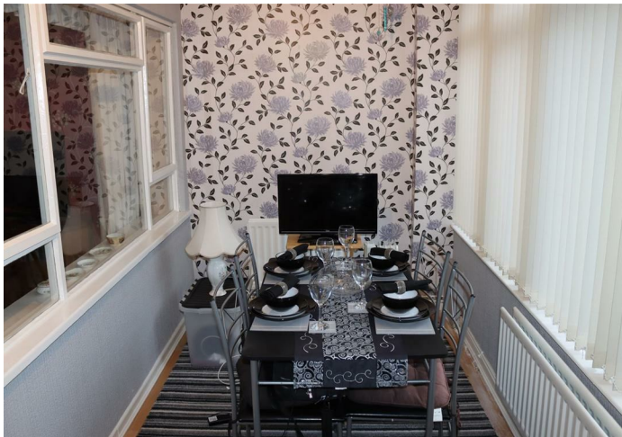
Sun Room/Dining Room