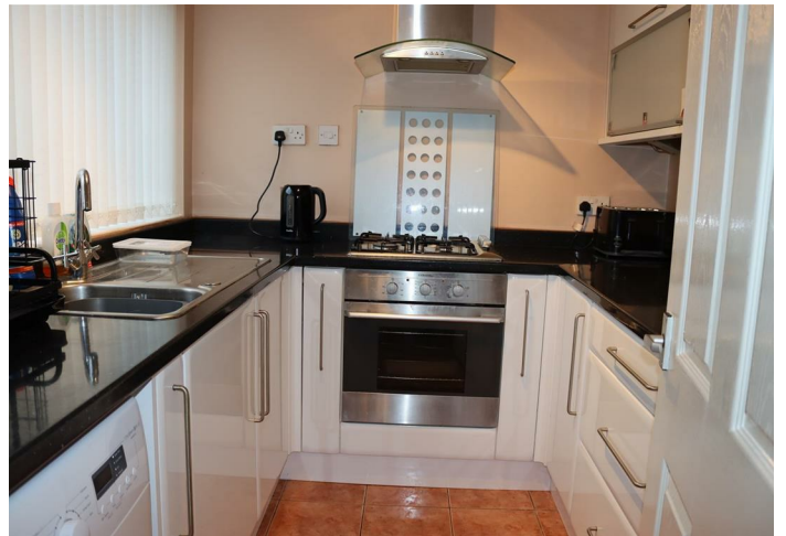
Modern Fitted Kitchen